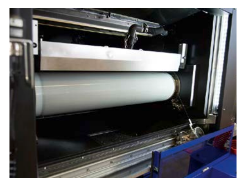
Long load length for more output