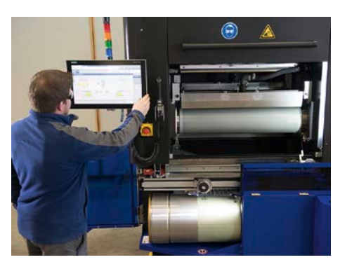
Easy operation for higher yield